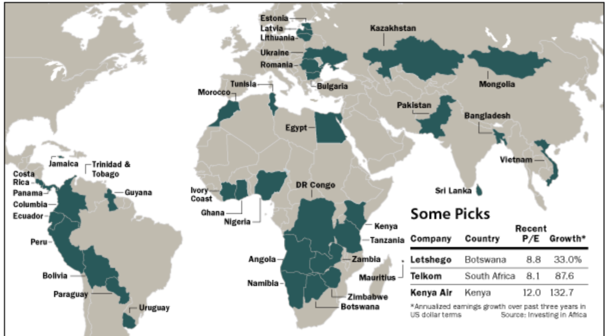
The New World: A sampling of frontier markets.